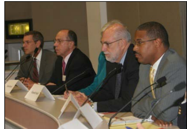
Commission Members at public hearing in Sacramento